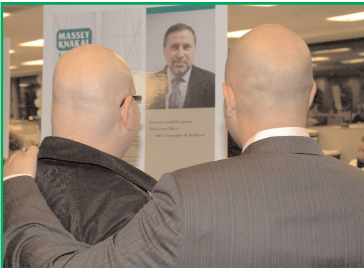
Any guesses who Mr. and Mr. Clean are?