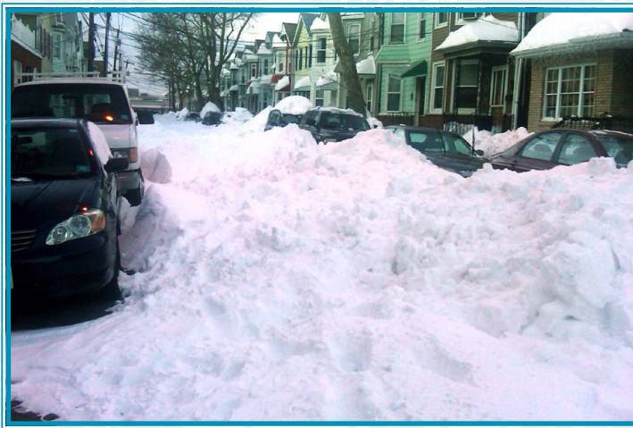
Christy Moyle's street in Newark