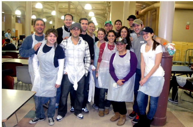
St. Francis Xavier Welcome Table - The gang