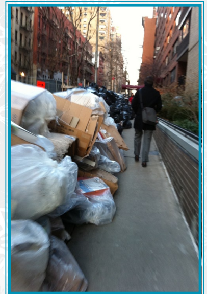
The aftermath! Piles of trash outside Shannon Krause's apartment - yuck!