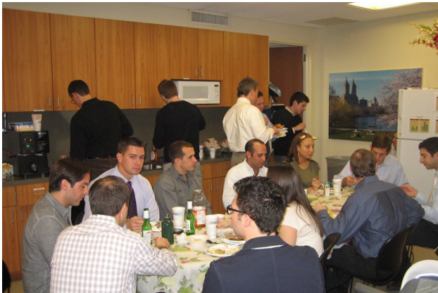
So much food!