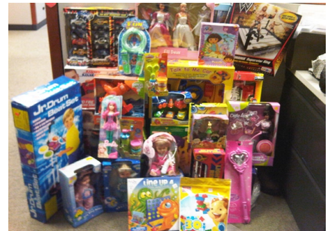
Toys for Tots