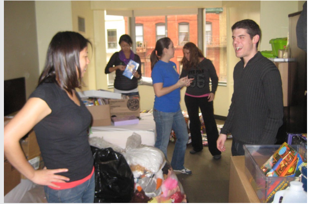
Ronald McDonald House of NY