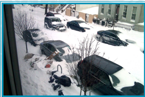
Streets of Park Slope from Eric Greenfield's window