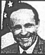
Mayor (212) 566-5700