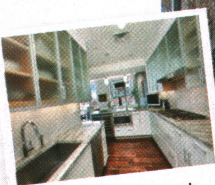
48 Bond Street