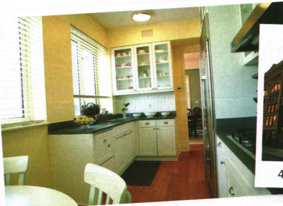
21 East 96th Street

Tel: 212.796.6901 | Fax: 646.291.8986 www.cpassociatesnyc.com