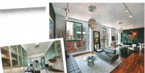
48 Bond Street