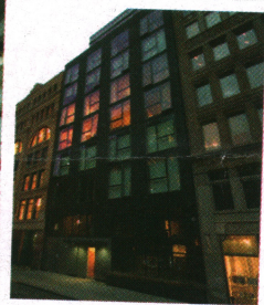
48 Bond Street