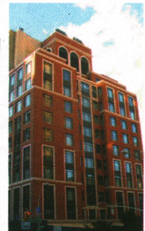
21 East 96th Street

A full service General Contracting and Construction Management firm, providing Property Management, Real Estate Investment and Acquisition consulting services.